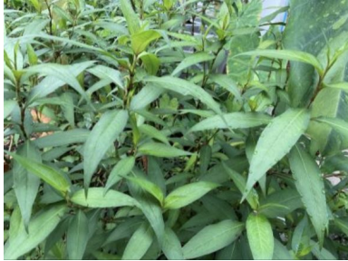
Kesum (Vietnamese mint)